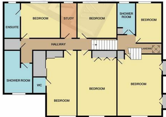
1ST FLOOR APPROX. FLOOR AREA 1404 SQ.FT. (130.5 SQ.M.)

TOTAL APPROX. FLOOR AREA 3323 SQ.FT. (308.7 SQ.M.)