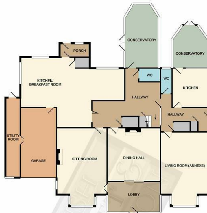
GROUND FLOOR APPROX. FLOOR AREA 1919 SQ.FT. (178.3 SQ.M.)